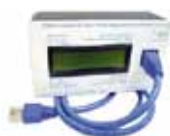
Hallett Diagnostic Tool (Optional on all models)