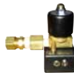
External Purge Valve (Optional on all models)