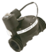
Automatic Shut-off Solenoid Valve (Optional on all models except Hallett 30 1.5")