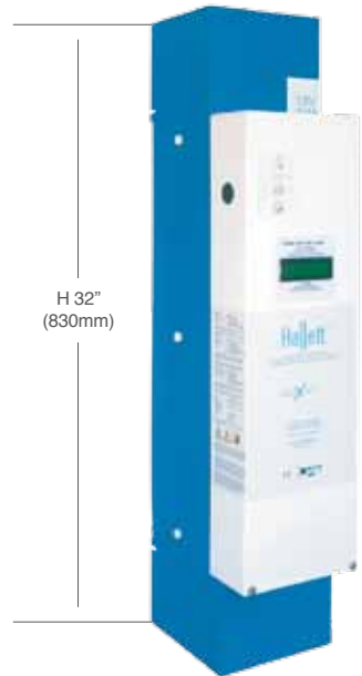
Hallett 30 4-20mA Data Output